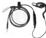
C-Style 3.5mm Wired Earpiece