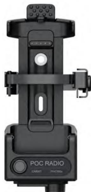
CK10 CAR KIT

The CK10 Car Kit is a rugged vehicle mounting assembly that enables the PNC380S to be installed on a vehicle dashboard and comply with DOT requirements. The Car Kit allows the PNC380S to be easily removed for handheld job-site communications. The Car Kit includes a locking bracket, an on/off power button, and ports for external speakers, microphones, and push-to-talk buttons. The CARKIT also functions as a docking charger for the PNC380S.