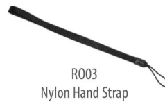
R003 Nylon Hand Strap