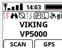
Day - High Contrast