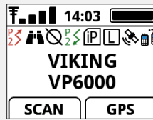
Day - High Contrast