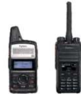
Hytera DMR Two-Way Radios