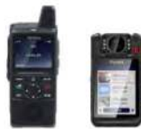
Hytera PoC Radios and Bodycams