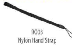
R003 Nylon Hand Strap