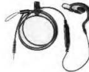
C-Style 3.5mm Wired Earpiece